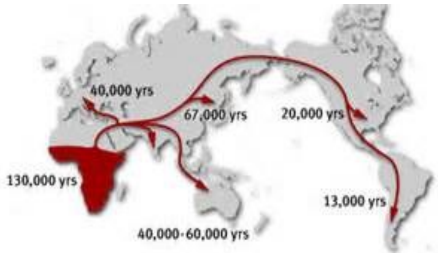
Human Migrations Out of Africa

I want to say I am having a great time sharing with you information about Japan. Japan is a really interesting country. I hope some day you can come here and visit me. I also want you to know Japanese young people really like hip hop music and fashion. Here in Japan young people listen to music by Beyonce, Rihanna and many others. Japanese children are now taking hip hop dance lessons at their schools. Hip hop dance is an official school subject in Japanese schools. Although I am now in Japan, I have also lived in China, Korea and Taiwan. Did you know black people have been living in Asia for thousands of years? Did you know the first people to live in Asia were black? In this newsletter we will learn about some of our black brothers and sisters who have been living in Asia for centuries.