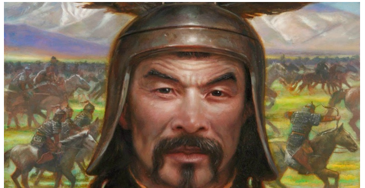
Genghis Khan, great leader of the Mongols.

For many years the nomads of Mongolia were made up of different tribes which often fought each other. In the year 1206 AD a great man named Genghis Khan, united the different Mongolian tribes. With Genghis Khan as their ruler, the nomads formed themselves into the Great Mongol Empire . Genghis Khan was a great military leader. He declared war on many nations and led the Mongols Empire to victory against many countries. The nations they conquered became part of the Mongol Empire. Due to their many military victories, Genghis Khan and the Mongols created the largest empire that ever existed before them.