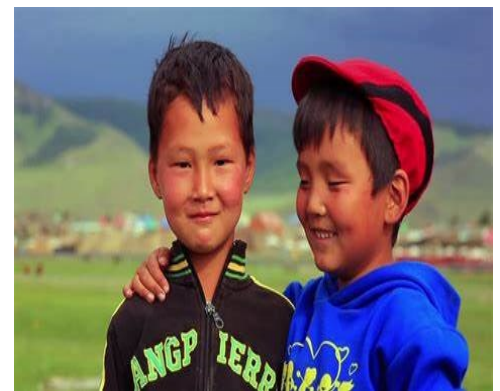
Children of Mongolia

foods. Due to covid-19, all the students at our school are required to wear masks. All the teachers have been vaccinated and we wash our hands at least 7 times per day. The students are also required to change their masks once a day.