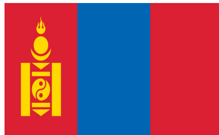
The flag of Mongolia

The people who live here are called "Mongols". Most Mongols here follow the religion called Buddhism.