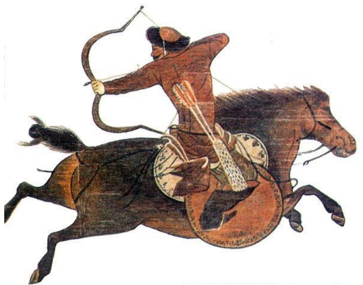
A Mongolian horseman.

Today, Genghis Khan is viewed as a great leader by the people of modern Mongolia. Many Mongolians today are proud of their heritage and history.