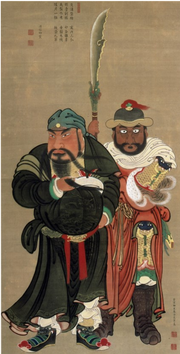
Painting of yellow and black skinned Mongols. Produced by Japanese artist Kanagisawa Kien (1703–1758).

When we study the early history of human beings we find black people were the first people to occupy the planet earth. These early black peoples traveled around the world. They were the first people to live in Europe, India, China and many other areas. Research in many areas of science has shown this to be a true.