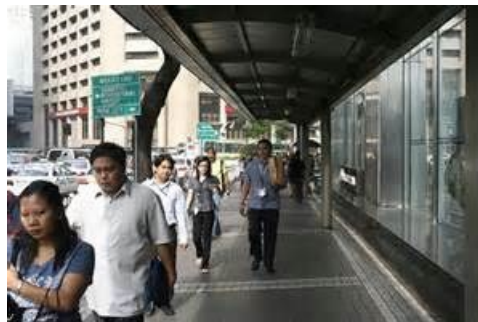
Manila, capital city in the Philippines

Also, we share the same physical features: kinky hair, broad nose, thick lips and dark skin.