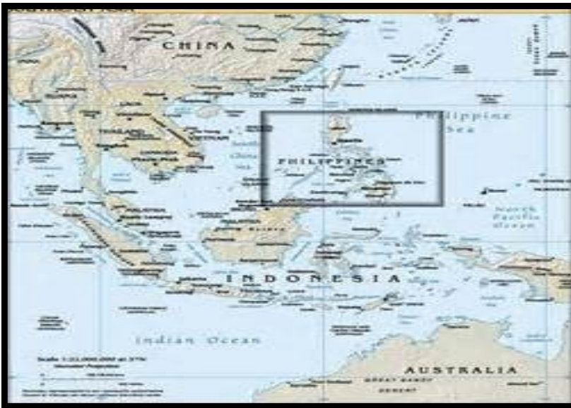
The Philippines on a map of Asia.