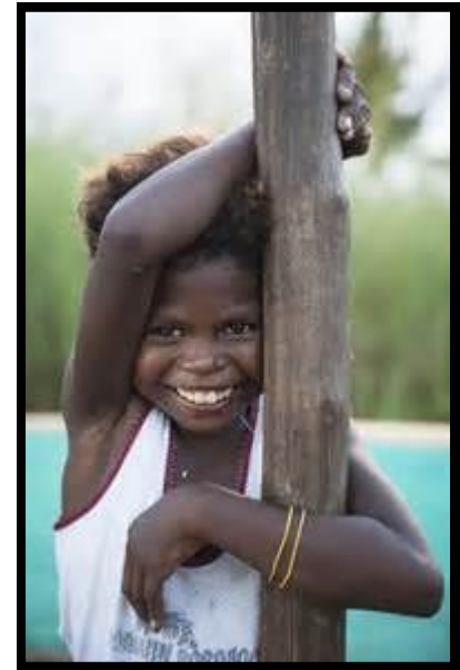
An Agta boy in the Philippines

Today these black peoples can still be seen in the Philippines. There are many names for them. For example, Negritos , Sakai and Semang . These are negative terms for the Blacks in the country. The proper term for them is Agta which means "the People".