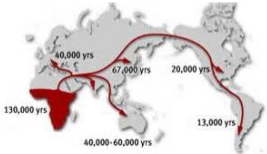
Human Migrations Out of Africa

I want to say I am having a great time sharing with you information about Japan. Japan is a really interesting country. I hope some day you can come here and visit me. I also want you to know Japanese young people really like hip hop music and fashion. Here in Japan, young people listen to music by Beyonce, Pharrell and many others. Japanese children are now taking hip hop dance lessons at their schools. Hip hop dance is an official school subject in Japanese schools. Although I am now in Japan, I have also lived in China, Korea and Taiwan. Did you know black people have been living in Asia for thousands of years? Did you know the first people to live in Asia were Black? In this newsletter we will learn about some of our black brothers and sisters who have been living in Asia for centuries.